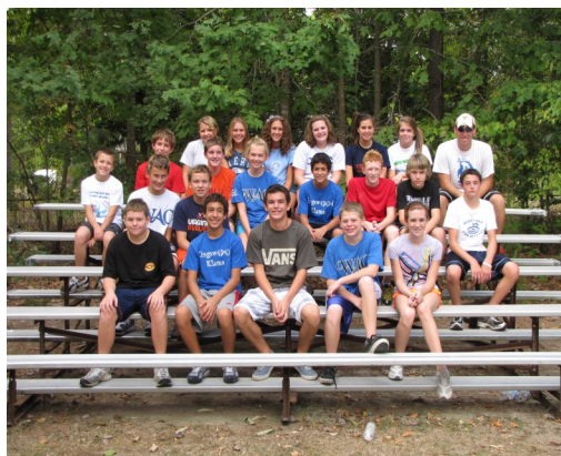
Level C held a "friendly" swimmers -v- parents kick-ball game and cookout on Saturday, Sept. 18th. (Left)

Have pictures or information that you would like to have featured in the WAC ATTACK?